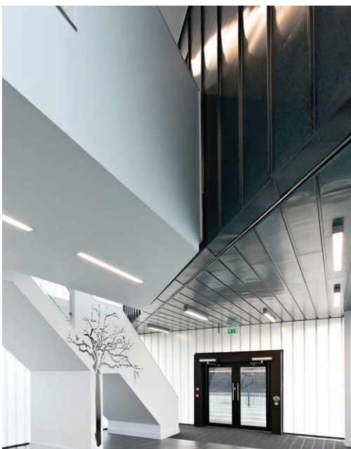
Central Rmz, Widnes, UK; Architects: Austin-Smith: Lord.

It can also be provided in a wide range of different forms and used in various systems.