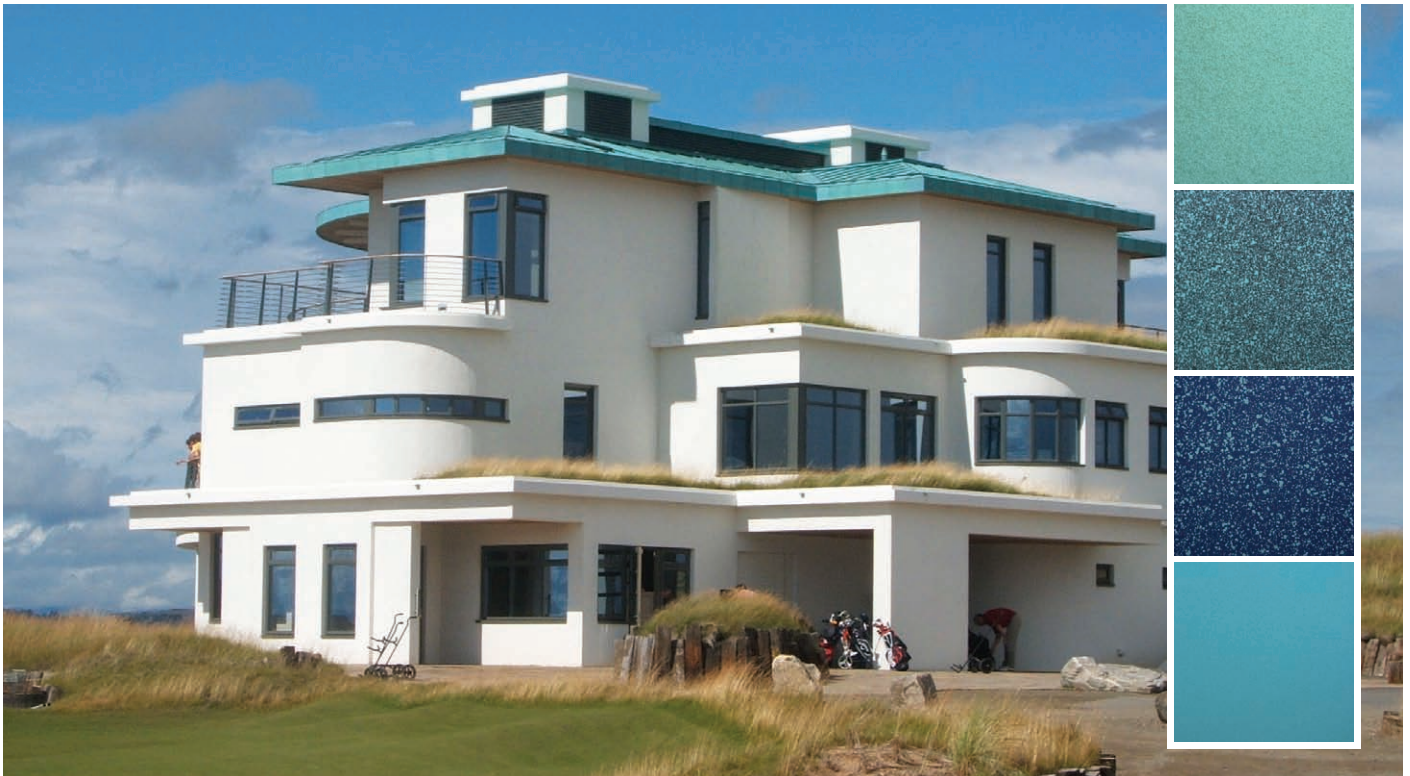
Castle Stuart Golf Links Clubhouse, Scotland; Architects: G1 Architects.