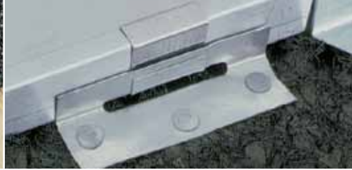
Permits expansion and contraction of cladding panels. Non-slip dimple texturing, not damaged when stepped on.