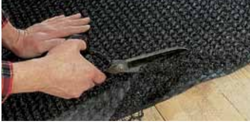
Simple and fast installation.