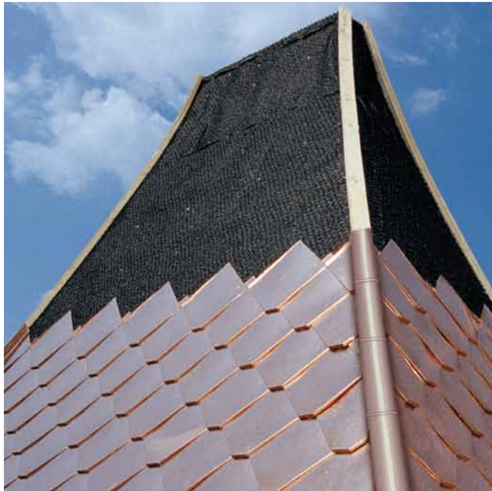
DELTA®-TRELA is the optimum air-gap sheet for high-quality metal roofs.

DELTA®-TRELA PLUS with the integrated self-adhesive edge provides even more energy savings and faster wind-tight installation.