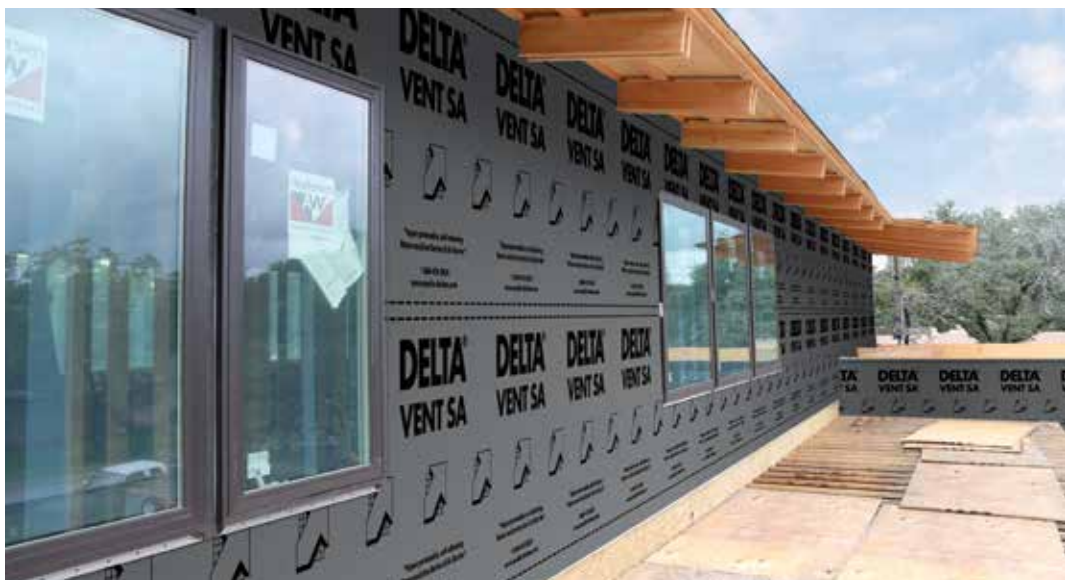
Private residence - Austin, Texas