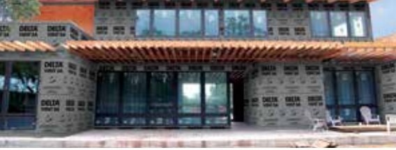
Premium energy-efficient construction