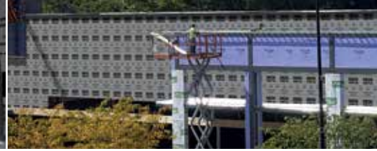
Commercial building enclosures