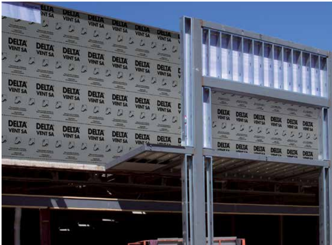
Whole Foods - Cherry Hill, New Jersey