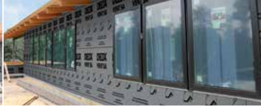
Air tight details